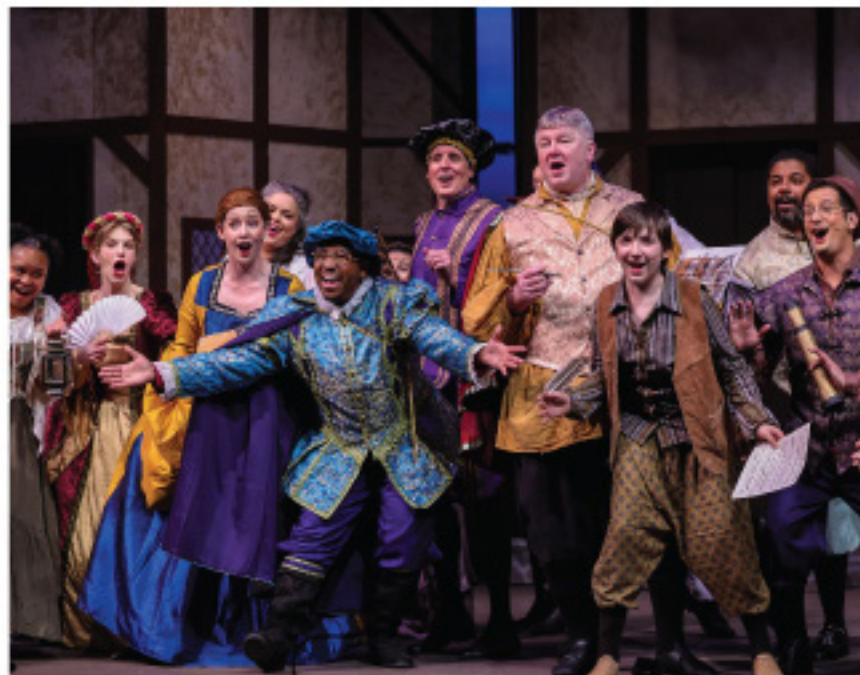
Cast of Something Rotten! , 2026